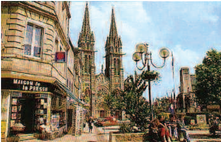
Church at La Ferté Macé

In 1986, Ludlow twinned with La Ferté Macé, Normandy, France; and then with San Pietro, Cariano, Northern Italy in 1992; and most recently in 2005 the Mayors of Ludlow and Narberth, Wales exchanged twinning certificates. Each twinning is organised separately, although they all share similar aims to encourage exchanges between families, schools and