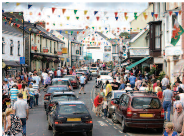
Narberth's Summer Festivals

Ludlow's Food & Drink Festival, held annually on the second weekend of September, is also a strong connection with Narberth, Ludlow's newest twinned town. The Pembrokeshire town holds its own Food & Drink Festival in late September. Narberth also has an award winning butchers, a historic ruined castle, craft galleries, gift shops and antiques shops. For more info contact Graeme Perks 01584 878202