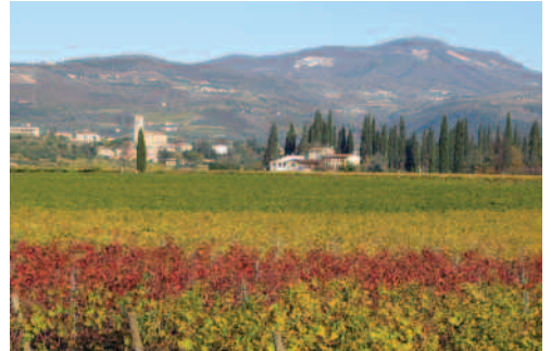
Pule vignete - The vineyards surrounding San Pietro