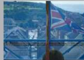
Roof top view