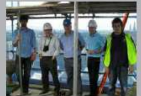
Buttercross 'Top Team'