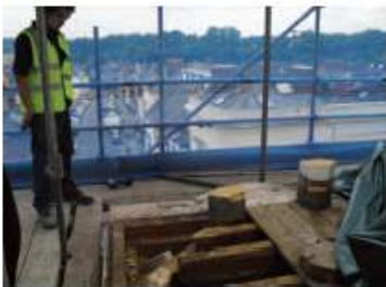
The Cupola has been removed for repair

The refurbishment of the cupola and other rooftop repairs are underway at the Buttercross. Treasures took over the site at the end of June and the work is expected to be completed in August.