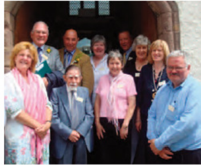
Ludlow in Bloom Committee with the judges