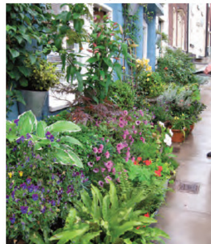
Old Street, Ludlow