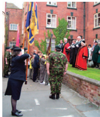
RBL Women & Parade Marshall