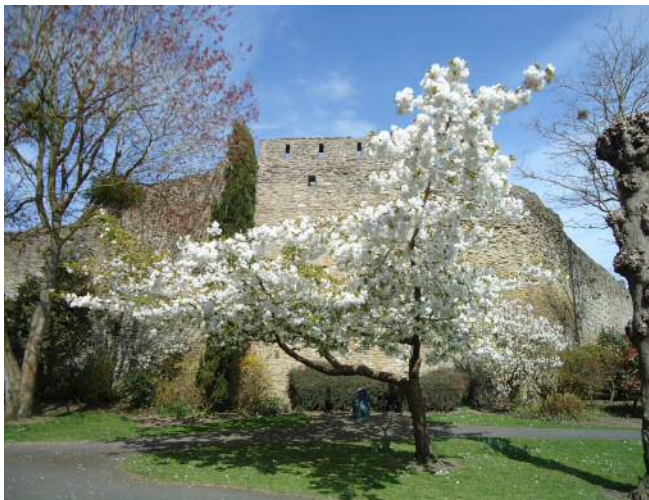
Above Castle Gardens Ludlow