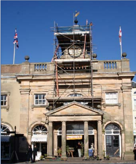
The Buttercross, a Grade 1 Listing Building owned by the Council, needs major repairs. Phase One is urgent work on the cupola.

Ludlow Town Council's share of your Council Tax bill this year will increase by 7.1%. This is to fund some one-off urgent projects, for which we are also applying for grants.