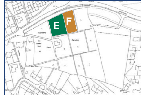
The Henley Road Cemetery, which is operated by the Town Council, includes a chapel and a toilet block.

Long-standing drainage problems need to be addressed in two areas of the cemetery, sections E and F in the plan reproduced above. This will involve groundworks.