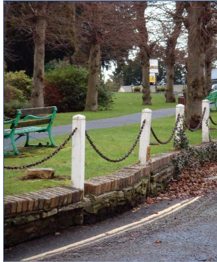
Sections of the retaining wall in Dinham Gardens are collapsing and damaging the fence. Repair work is clearly needed.