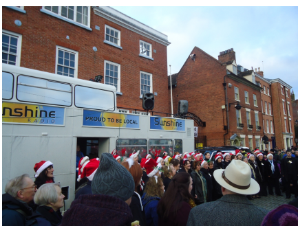
Above: Sunshine Bus and Got 2 Sing Choir