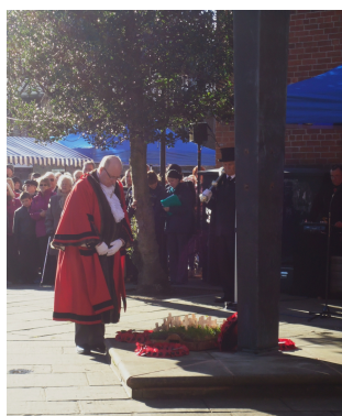
Above: Mayor of Ludlow 2013