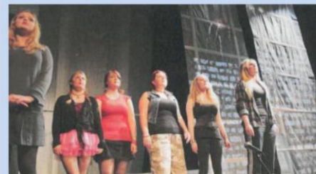
from Bad Girls

The grant helped replace the obsolete microphones and were used in the performance of Bad Girls as shown in the photograph below.