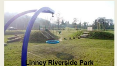
Linney Riverside Park

The Linney Riverside Park is a great place for family fun with a new exciting play park that opened in 2012. Picnic benches, toilets and car parking are all available on this site.