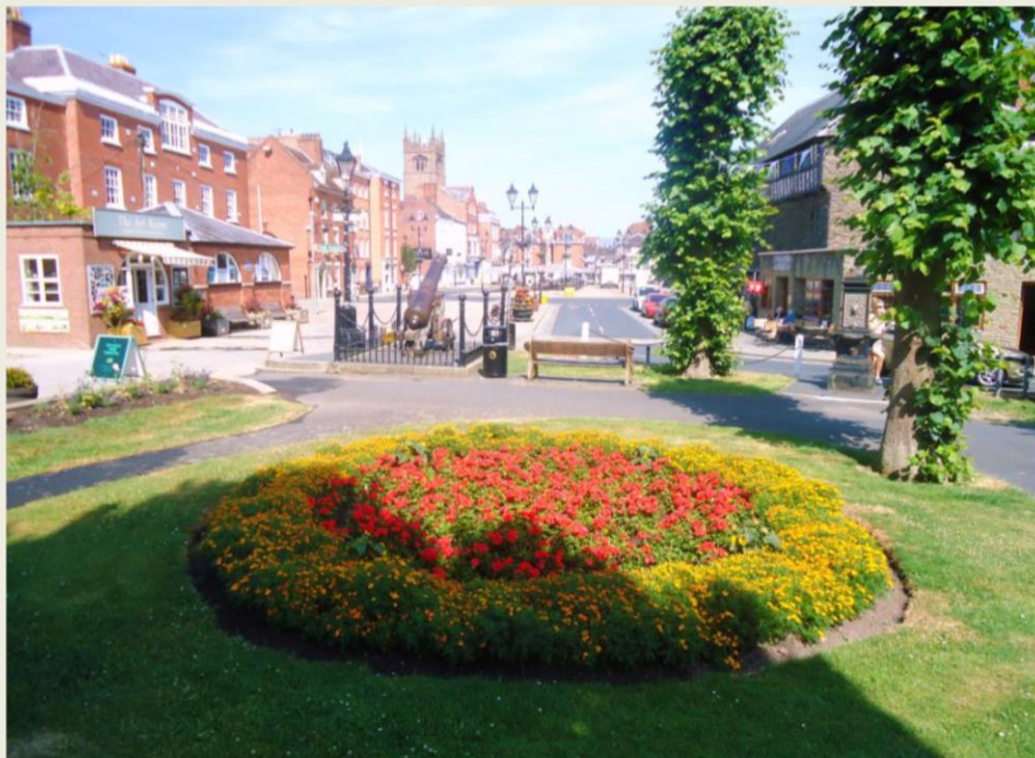
Castle Gardens and the Ludlow Town Council planted flowerbed

For more information visit: www.ludlowinbloomtbck.co.uk