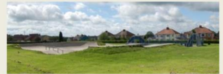
Wheeler Road Skate Park

Wheeler Road playing fields has been supported and developed over recent years with a children's play area, MUGA, skate park and playing field. The Boxing Club is nearing completion and will open in November.