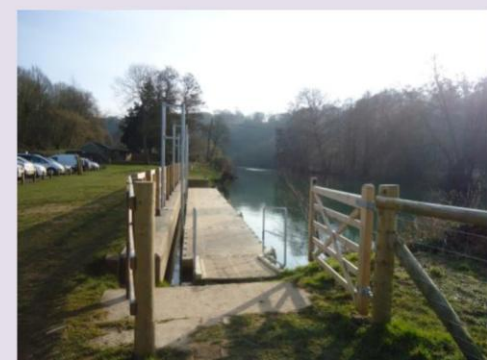
Linney Riverside Park Jetti

Ludlow Town Council is looking for expressions of interest to run the Linney public boating. If you are interested please contact the Town Clerk with a business plan at the Guildhall, Mill Street, Ludlow, SY8 1AZ or email townclerk@ludlow.gov.uk