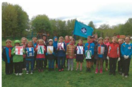
Photograph of Ludlow's Beaver Colony and their new flag.

The Council awarded a grant to 1 st Ludlow Scouts in early 2013. The money was used to buy a P A System for the scout HQ. This has been used on quiz nights, bingo nights, as well as weekly use by the bands that use the scout hut to practise.