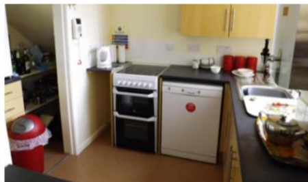
Upper Fee Community Room and new cooker

Ludlow Town Council donated £200.00 last year to the South Shropshire Housing Association. This was to help purchase a cooker as part of a new kitchen at the Upper Fee Community Room in Ludlow.