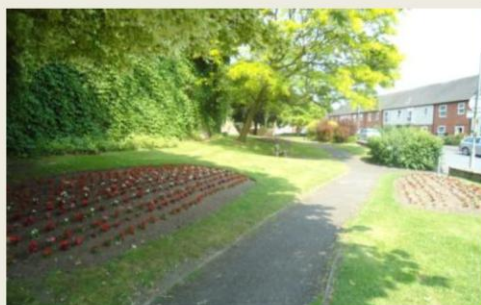
St John's Gardens flower beds and benches

Ludlow Town Council Services Committee has recommended perennial planting to encourage biodiversity and support important insects including bees and butterflies