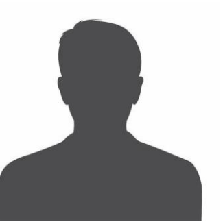
Vacancy Rockspring Ward