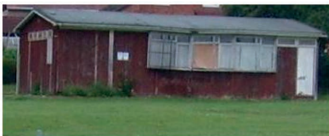
The old dilapidated boxing club

The Old Boxing Club (pictured right) on Wheeler Road Recreation Field is in such a bad state of repair it has been condemned. Working with members of the Boxing Club, Ludlow Town Council (LTC) has led the way to build a