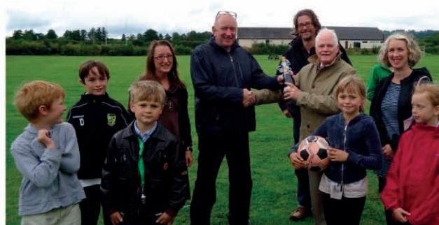
Mayor of Ludlow & Friends of Linney Riverside Park

The project is also supported by S106 funding allocated for recreational facilities in Ludlow by Shropshire Council.