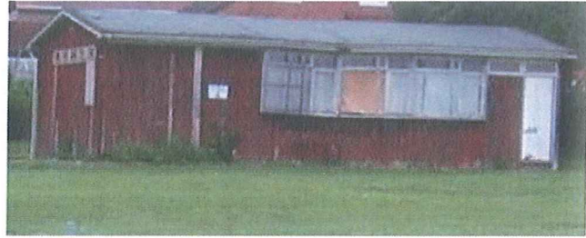
The old dilapidated boxing club

The Old Boxing Club (pictured right) on Wheeler Road Recreation Field is in such a bad state of repair it has been condemned. Working with members of the Boxing Club, Ludlow Town Council (LTC) has led the way to build a