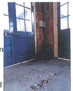
Suspiciously damp corners and cigarette

Phase II works have now been completed. The final phase involves internal works which include re-plastering the internal ceiling; a grant application for the re-plastering work has been submitted to English Heritage. Not everything is as fresh as it might be though, despite renovations the market area of the Buttercross is exposed to continual abuse as a make shift public convenience and littered with cigarette ends. Please let us have your suggested solutions to this anti-social behaviour.