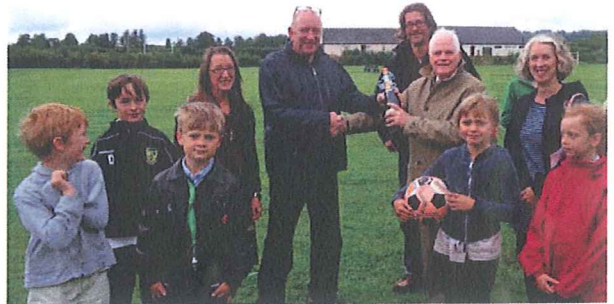
Mayor of Ludlow & Friends of Linney Riverside Park

The project is also supported by S106 funding allocated for recreational facilities in Ludlow by Shropshire Council.